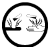
E - Corrosive