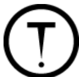
D2B - Toxic

D2B - Toxic materials, Eye irritation Class E : Corrosive to aluminum. Not corrosive to animal skin or carbon steel.